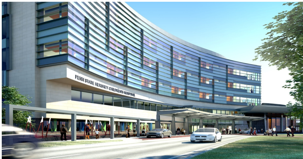
IMAGE 2 New Children's Hospital at the Penn State Milton S. Hershey Medical Center

To complete the construction of the $115 million state of the art facility, Hershey Medical Center contracted with L.F. Driscoll, Co LLC as the Construction Manager at Risk with a GMP contract. The Construction Manager is in direct contractual agreements with the subcontractors on-board. The general liability insurance is covered by L.F. Driscoll under a Contractor Controlled Insurance Program (CCIP). The project substantial completion of the Children's Hospital is scheduled to be on 8/20/2012.