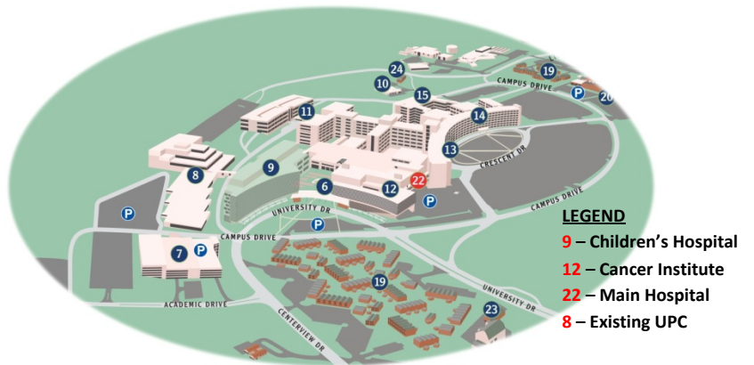
IMAGE 1 PSU HMC Campus Map

The site for the new Children's Hospital is surrounded by 2 major buildings. Just north of the Children's Hospital lays the existing Cancer Institute Building that directly joins with the new Children's Hospital. On the west side the Children's Hospital joins with the existing Main Hospital Building. The new Children's Hospital